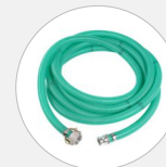
INFLATION HOSE 10m 574578