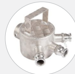
3-WAY DISTRIBUTOR 574579